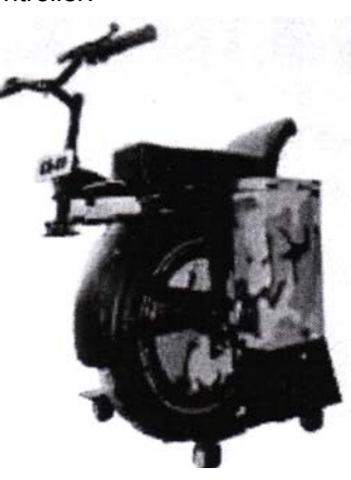
Assembled view of single wheeled electric bike (Prototype)